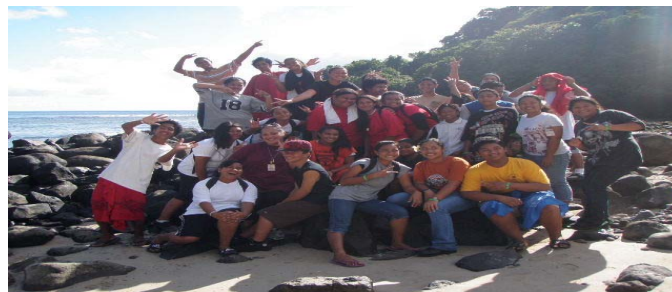
AS Dept. Agriculture Camp field trip to Malota