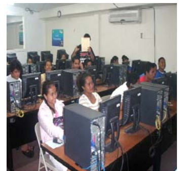
Algebra Camp in the ITT Lab