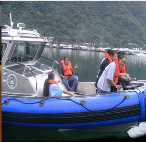
Marine Science Camp Boat Tour