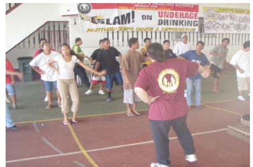
Dept of Health Aerobics Session's

The site for each camp depended on the activity and the partner agency hosting. Kids rotated through different camps over the three weeks ending Thursday, July 2nd. Camp participation was free. All costs were covered through local and federal resources provided by participating agencies and community partners. This year's GEAR UP mini camps offered a great variety of focus areas accommodating a range of interests and skills of participating students. The partnership, supported by seven major government agencies and the