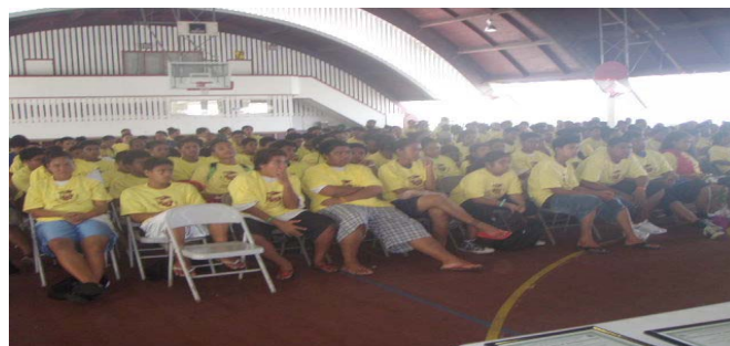
Summer Camp closure July 2, 2009