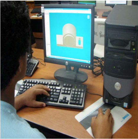
Autodesk Camp Inventor 2009 Software