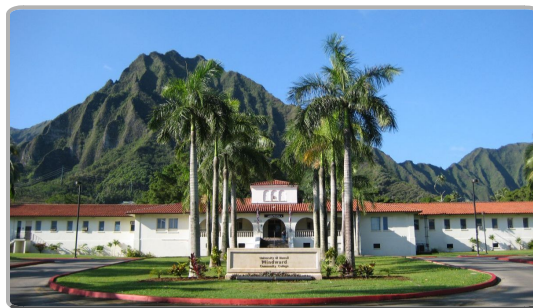
Windward Community College