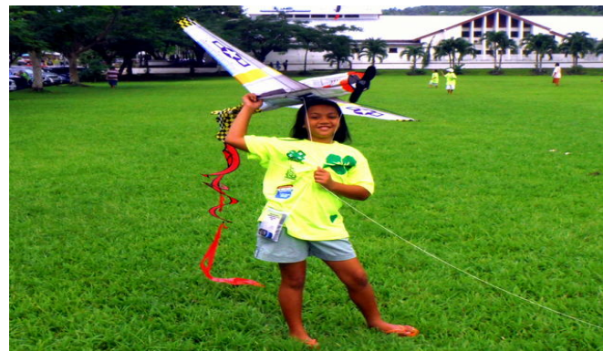
Kites on ASCC Campus-C.N.R. Summer Camp

It is expected that all students respect the facilities and resources on campus. Students are not allowed to be in the classrooms while class is not in session, unless for a pre-approved activity or with a faculty or staff member.