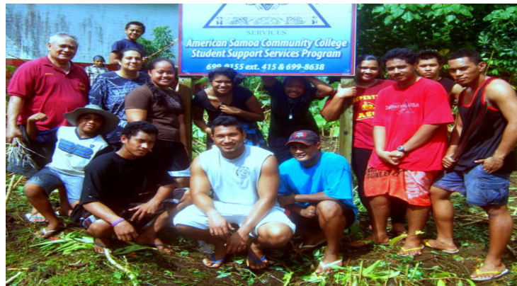
Student Support Service Club working on their plantation project with Advisor.