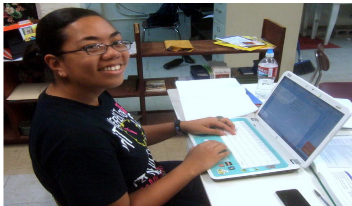
ASCC PTK Student working hard on her term paper.

In addition to disciplinary sanctions imposed by the College for violation of alcohol, drug, weapons and fighting policies, students may also be prosecuted under Territorial and Federal Laws.