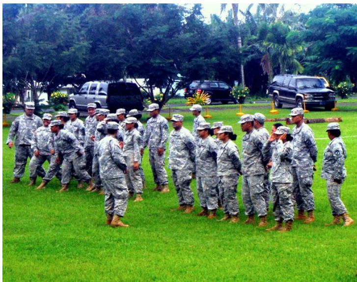
R.O.T.C. Class training exercises

In compliance with the Student-Right-to-Know and Campus Security Act of 1990 is the policy of the American Samoa Community College to make available its completion and transfer rates to all current and prospective students.