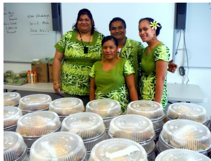
C.N.R. Land Grant Staff

There are two computer labs, one under the direction of the ITT, ITC computer lab and the PC lab, available to the students and faculty members. One is located in room 15 and the other is located on the lower campus areas across from the Fale Samoa. Lab hours are 8:00 a.m. – 4:00 a.m., Monday – Friday except Holidays. Please refer to the student handbook for the computer lab fees for printing (black and color), making copies, scanning, faxing, and also rules and regulations for the facility and its equipment. A monitor is ready to assist you at each location.