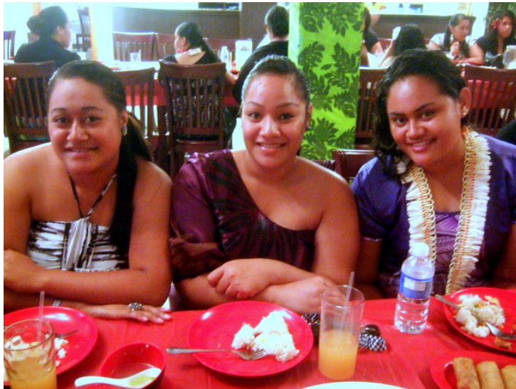
Graduation Award Banquet for Graduates

Family Policy Compliance Office U.S. Department of Education 600 Independence Avenue S.W., Washington D.C. 2020-4605