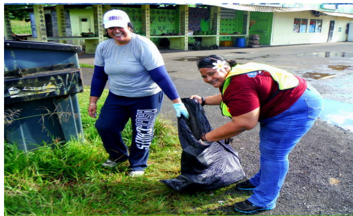
ASCC Staff on Going Green!

Additionally, a non-U.S. Citizens/Nationals can apply for “American Samoa Residency Tuition Status” if the student has resided in the Territory of American Samoa for FIVE consecutive years prior to applying for admission. Application for AS Residency Tuiton Status is available at the Admissions and Records office. Supporting documents must be submitted along with the application. Tuition and Fees for non-US Citizens/Nationals are listed under the “Tuition & Fees” section on page 32.